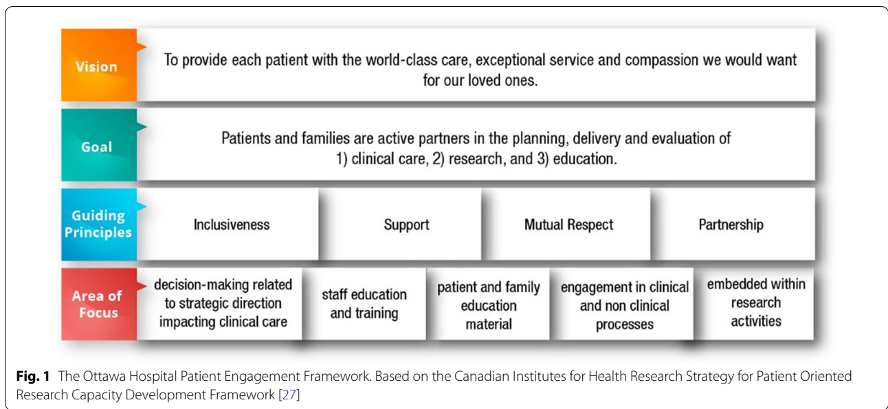
Fig. 1 The Ottawa Hospital Patient Engagement Framework. Based on the Canadian Institutes for Health Research Strategy for Patient Oriented Research Capacity Development Framework [27]