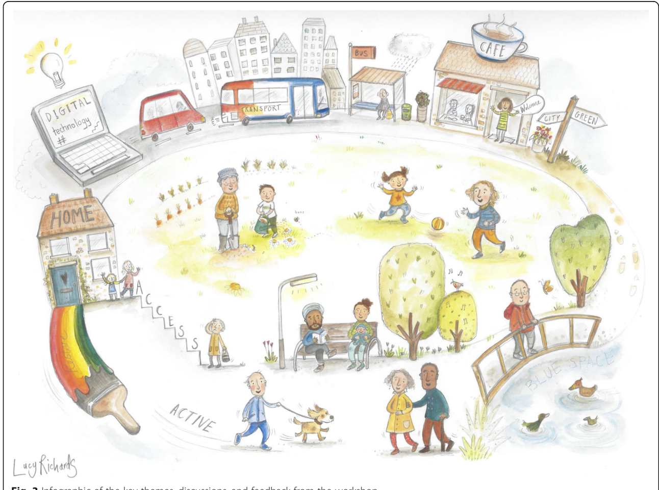
Fig. 3 Infographic of the key themes, discussions, and feedback from the workshop

included the development of technologies that address 'hazard awareness' (e.g. pedestrian safety). As well as being used for safety, assistive technology can affect where and how people live for example, driverless cars and smart homes [38]. Technology can also be used to reduce social isolation [45] and can improve care and quality of life [46], yet concerns were also identified around privacy, monitoring and digital exclusion.