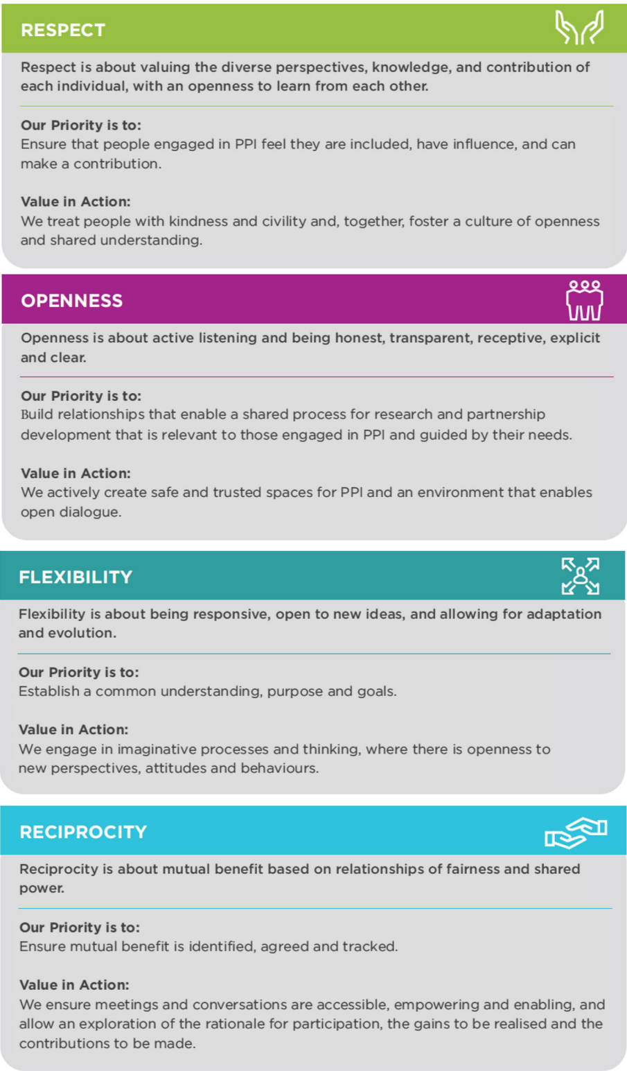
Fig. 3 Values Explained